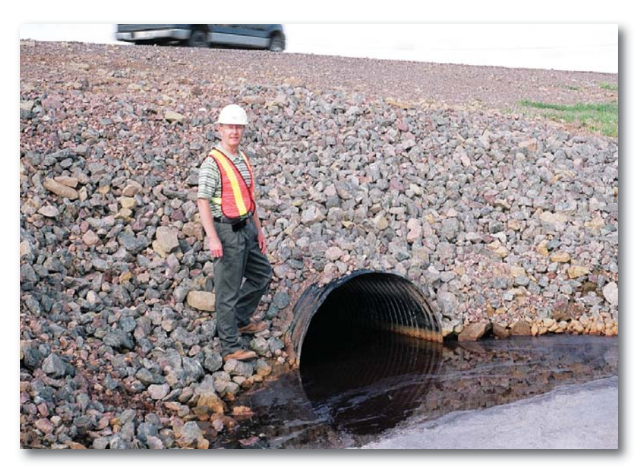
An engineer from a Member Company of the Corrugated Steel Pipe Institute inspects the new PLCSP culvert installation.

rivers, creating fresh water lakes behind the aboiteaux.