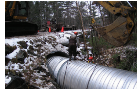
A BAND TYPE COUPLER IS TIGHTENED AROUND PIPE ENDS TO PRODUCE A VERY STRONG JOINT

They have a relatively low cost and are economical to install because of their lighter weight compared to competitive pipe fittings.