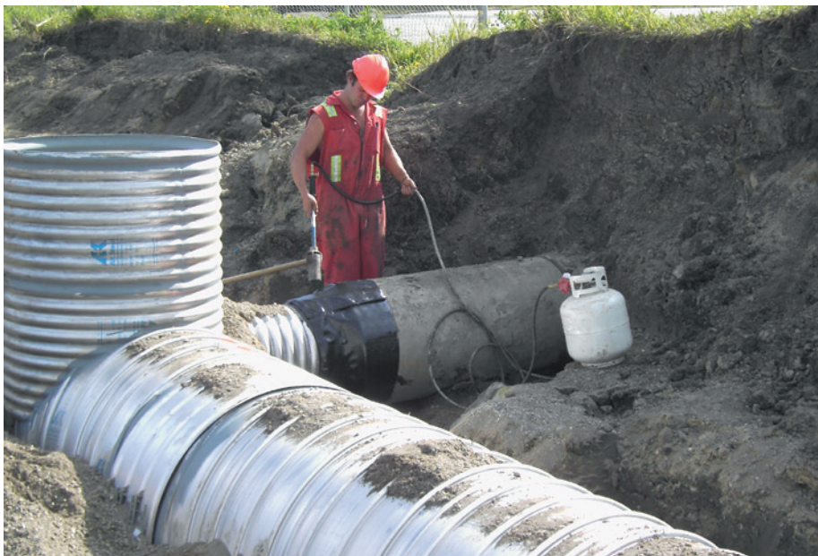
A TEE IS SHOWN COMBINING A STANDARD HEL-COR STUB WITH AN ULTRA FLO STORM SEWER PIPE