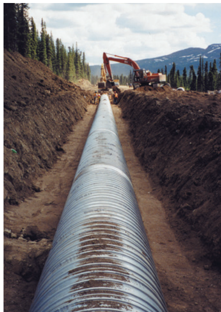
LONG LENGTHS AND POSITIVE JOINTS ASSURE GOOD ALIGNMENT AND LEAK RESISTANT PERFORMANCE