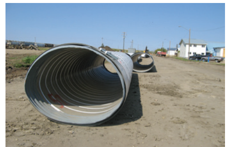
ULTRA FLO STEEL PIPE