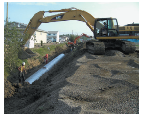
ULTRA FLO PIPE CAN BE INSTALLED IN TIGHT CONSTRUCTION ZONES