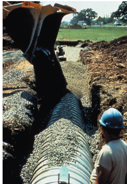
ULTRA FLO STEEL PIPE - BACKFILLING

Backfilling is an important ingredient in the structural design. Material placement and compaction must be done in accordance with the guidelines.