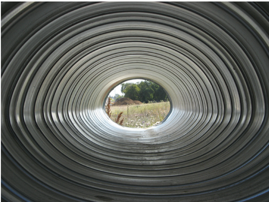
PIPE-ARCH SHAPES CAN BE SUPPLIED WHERE THERE IS LOW HEADROOM

For additional information, contact your nearest Armtec sales office.