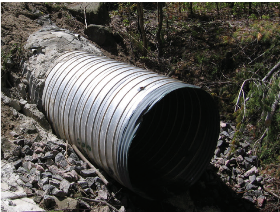
ULTRA FLO STEEL PIPE